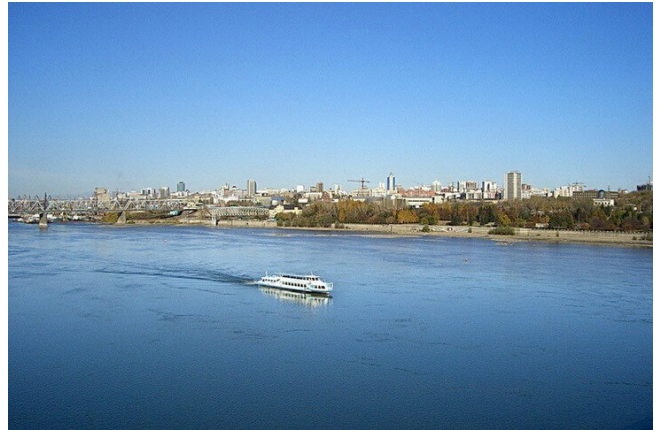
View of the center of Novosibirsk from the Ob river

Academic campus is scientific visit card of the Siberian capital, it is located in the immediate vicinity of the Ob Sea. Since 1959, dozens of scientific institutes have settled here together with Novosibirsk State University. Some of them carry out research in seismology. During the conference, participants will be able to get acquainted with the advanced developments of local seismological scientists, as well as visit the vibroseismic test site in the village of Bystrovka, where unique models of vibration sources are collected. They allow to carry out studies with seismic deep sounding of the earth's crust and upper mantle and monitor the stress-strain changes in the rock mass on huge territories.