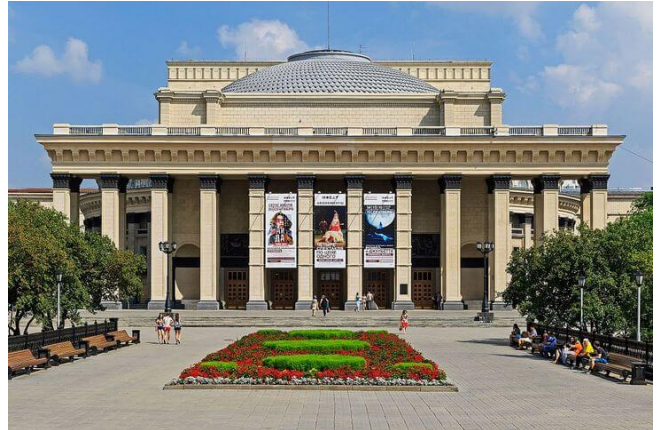
The building of the Opera and Ballet Theater